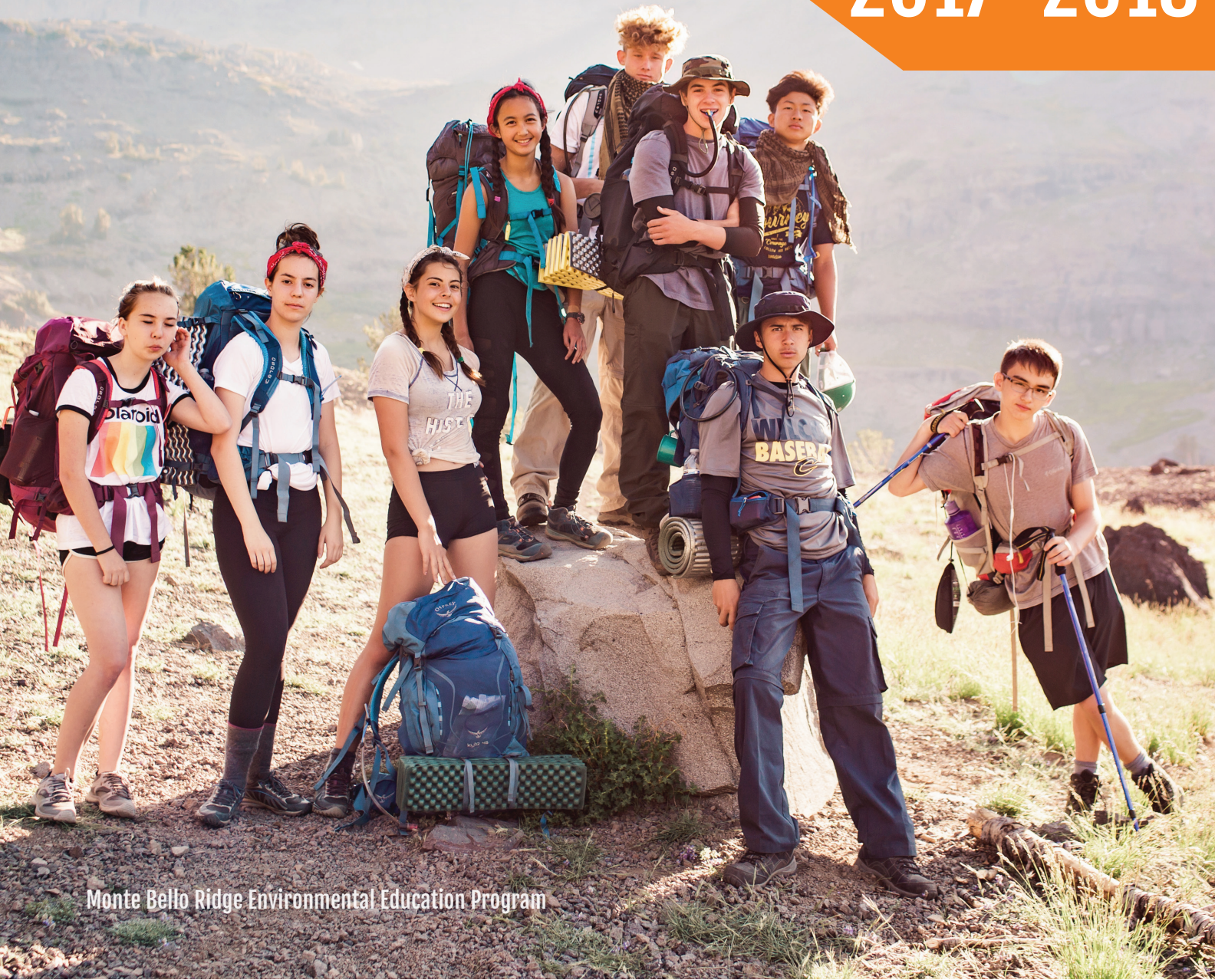
Monte Bello Ridge Environmental Education Program